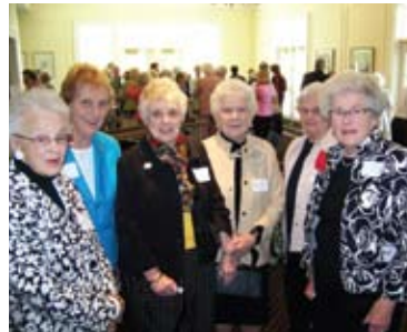
The Coterie of St. Augustine's Annual Spring Luncheon was held at Westwood Country Club. The Coterie (the womens' auxiliary) enhances all aspects of life at St. Augustine by giving of their time, talent and treasure

Many schools and community groups brought love and much needed assistance to our Campus. Some of these included, Single Volunteers, AARP, Catholic Charities Associate Board, Key Bank, Wellpoint, City Year City Serve, Baldwin-Wallace College, John Carroll University and R.S.V.P.