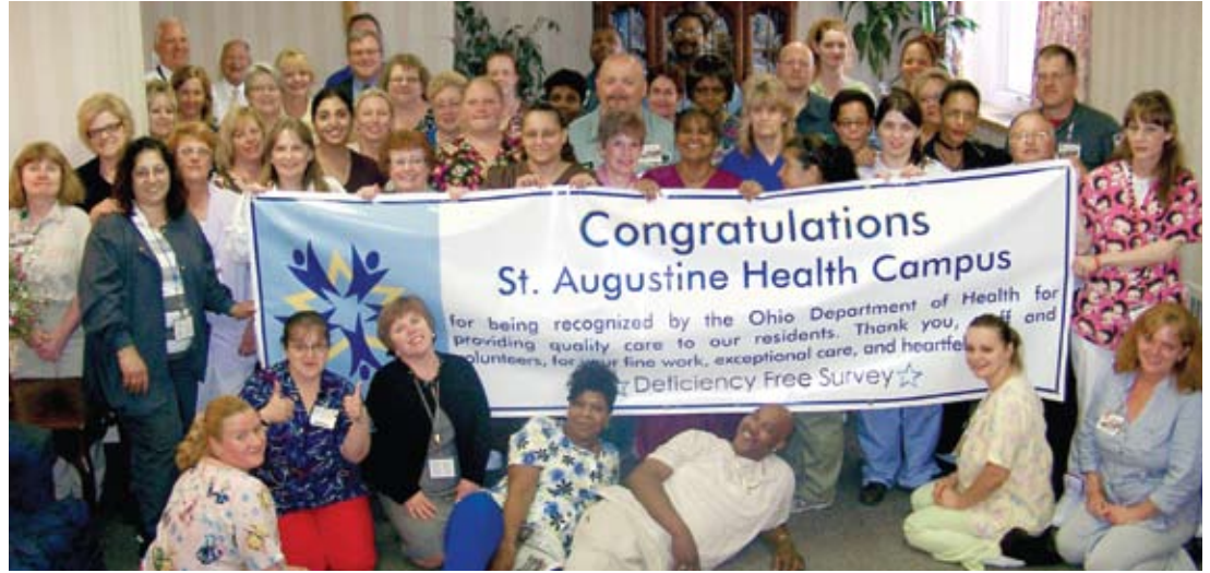
Celebrating the perfect survey!