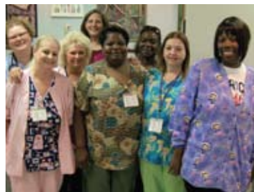
Posing for the camera, these staff members represent more than 127 years of experience in Nursing.